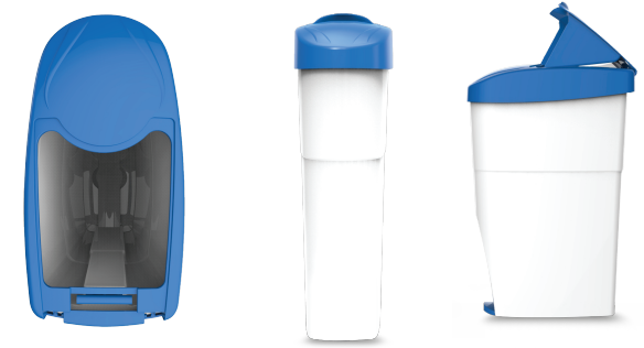
Top view Front view Side view

spot checks by our quality management team to ensure top quality service